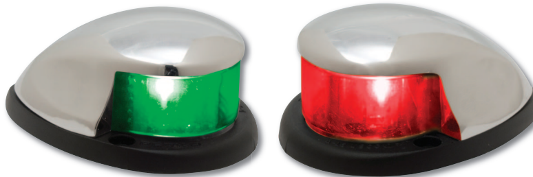
Fig. 0628 Horizontal mount