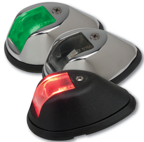
Fig. 0274 Vertical mount